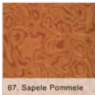
67. Sapele Pommele