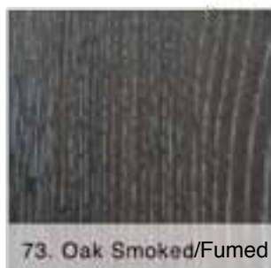
73. Oak Smoked/Fumed