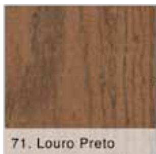
71. Louro Preto