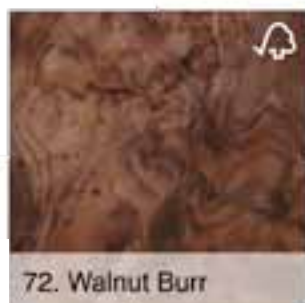
72. Walnut Burr