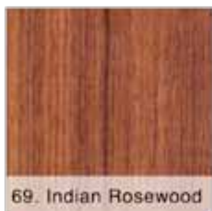
69. Indian Rosewood