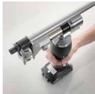
3 Apply compression sleeve