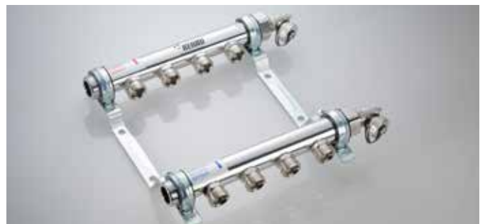
Heating pipe manifolds made of stainless steel: extremely compact thanks to reduced gaps between the outlets.

Our range of pipes, fittings and accessories make it possible to implement any common installation variant. Heating pipe manifolds for distributing and gathering connecting pipes round out the product range.