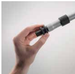
2 Insert fitting