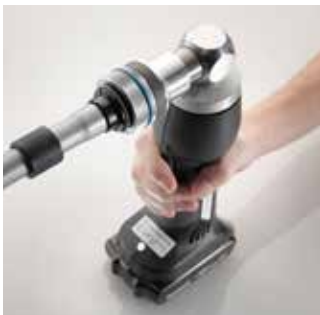
1 Expand pipe end