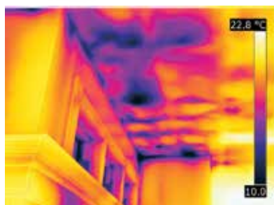
Quickly detect moisture intrusion and building deficiencies