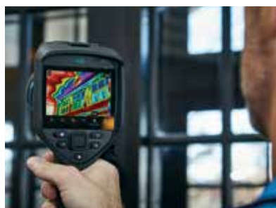
One-handed operation with convenient buttons for safe, streamlined use