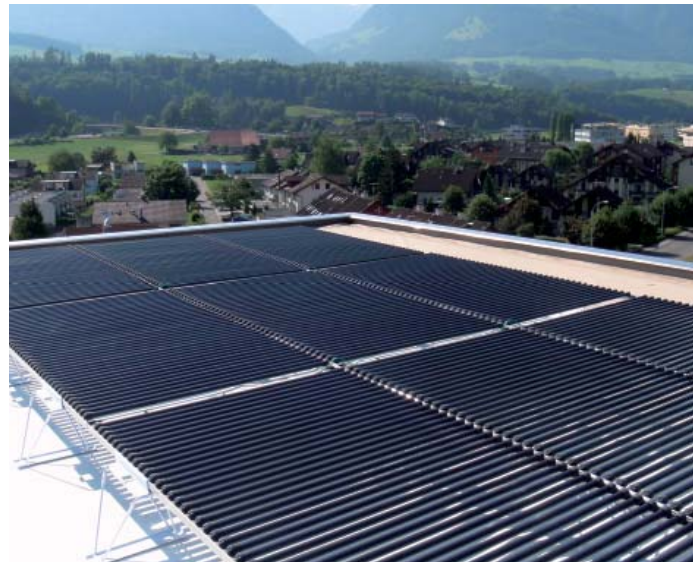
Sika Solar Park Sarnen, Switzerland

Sika Solar Parks in Stuttgart, Canton and Sarnen are comparative installations for different photovoltaic systems. Solar enthusiasts, architects, roofers and PV installers get the chance to have a look at different possibilities how PV can be installed to membrane-covered flat roofs. Sika therefore demonstrates, based on currently 8 different installations, its Solar competence for all interested parties.