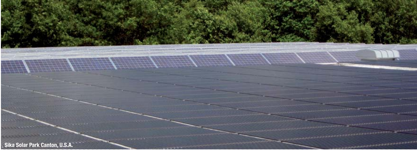
Sika Solar Park Canton, U.S.A.