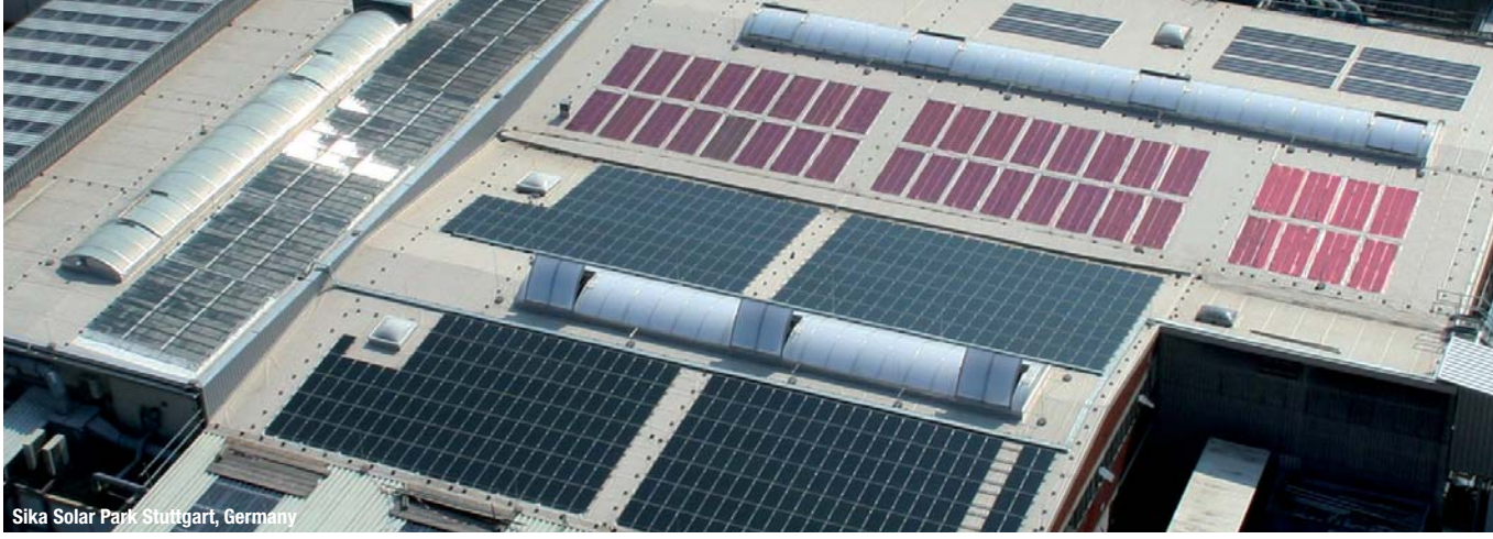
Sika Solar Park Stuttgart, Germany